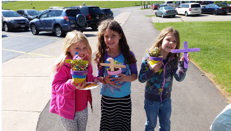
On their last day of Sunday School, the kids helped plant pumpkin seeds in the garden!