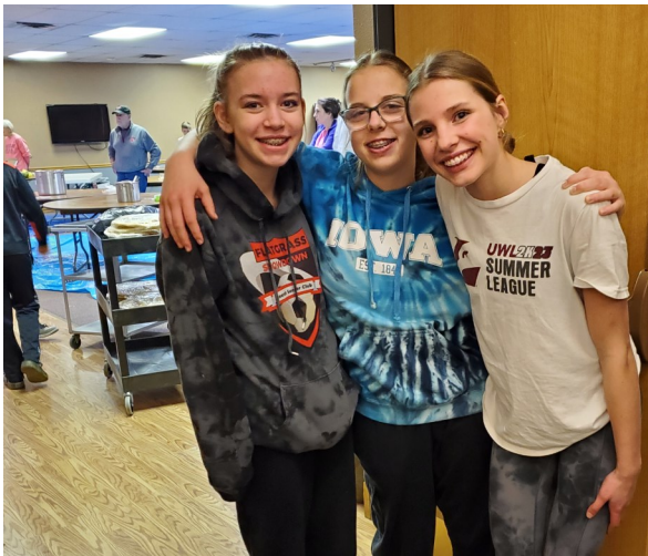
Making over 300 pizzas and still smiling!