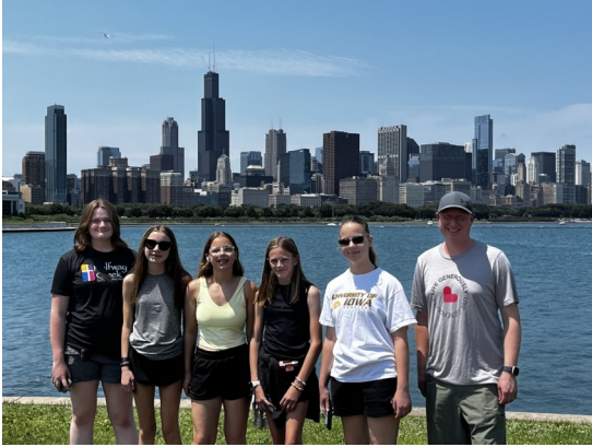
While in Chicago, we went to a planetarium to pass the time, and outside there was a beautiful view of Lake Michigan and the city.