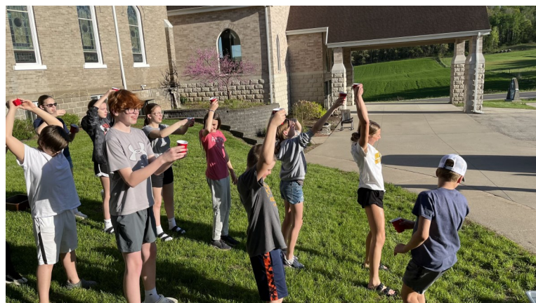
May 8th—end of year party and outdoor games.